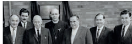
Official opening of the Gosbecks Road factory in 1964

Master cabinet-makers by trade, the brothers were craftsmen before they were businessmen. Nevertheless their shop quickly prospered, with loyal customers spreading the word about the brothers' charming, well-made cabinets. Towards the end of the century they were able to move to Sudbury's bustling Old Market Place, where they opened up a larger shop with cabinet and upholstery making workshops located behind.