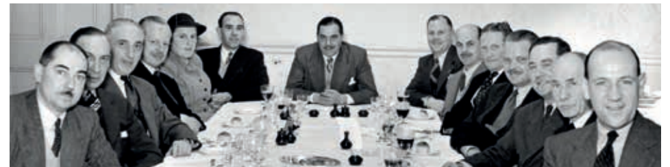
Alstons sales meeting c. 1955